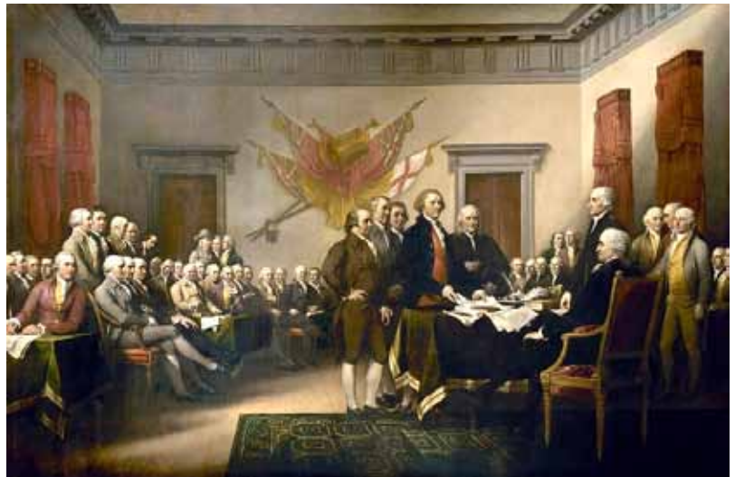
Committee of Five presents their draft of the Declaration of Independence to the Second Continental Congress in Philadelphia

While Jefferson consulted extensively with the other four members of the Committee of Five, he largely wrote the Declaration of Independence in isolation over 17 days between June 11, 1776, and June 28, 1776, from the second floor he was renting in a three-story private home at 700 Market Street in Philadelphia, now known as the Declaration House, and within walking distance of Independence Hall.