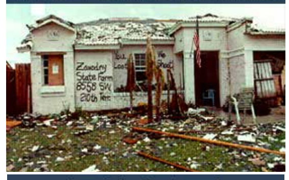
Level 4 - Destroyed